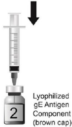
Figure 2. Slowly transfer entire contents of syringe into the lyophilized gE antigen component vial (brown cap). Vial 2 of 2.