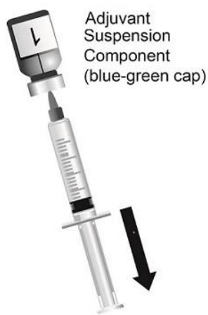
Figure 1. Cleanse both vial stoppers. Using a sterile needle and sterile syringe, withdraw the entire contents of the vial containing the adjuvant suspension component by slightly tilting the vial (blue-green cap). Vial 1 of 2.

products should be inspected visually for particulate matter and discoloration prior to administration, whenever solution and container permit. If either of these conditions exists, the vaccine should not be administered.