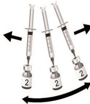
Figure 3. Gently shake the vial to thoroughly mix contents until powder is completely dissolved.