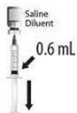
Figure 1. Cleanse both vial stoppers. Withdraw 0.6 mL of saline diluent from accompanying vial.

HIBERIX is to be reconstituted only with the accompanying saline diluent. The reconstituted vaccine should be a clear and colorless solution. Parenteral drug products should be inspected visually for particulate matter and discoloration prior to administration, whenever solution and container permit. If either of these conditions exists, the vaccine should not be administered.