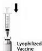
Figure 2. Transfer 0.6 mL saline diluent into lyophilized vaccine vial.