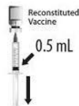
Figure 4. After reconstitution, withdraw 0.5 mL of reconstituted vaccine and administer intramuscularly .

Use a separate sterile needle and sterile syringe for each individual.