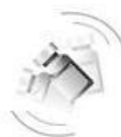
Figure 3. Shake the vial well.